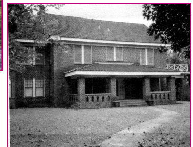
Another early home