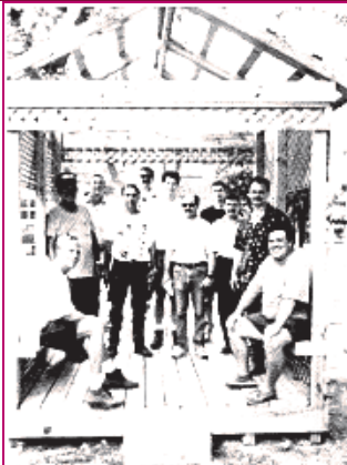
Our many volunteers Through the years