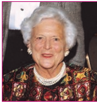
First Lady Barbara Bush