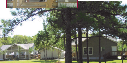
The start of our Village