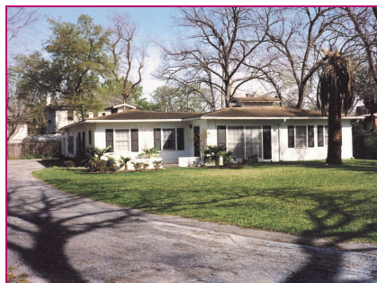
Our first home