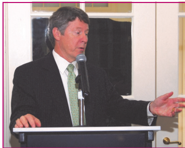
County Judge Ed Emmett