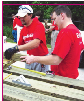
Shell and Exxon-Mobil employees with Day of Caring